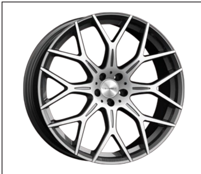
N.80 Wheels 19 inch - ANTHRACITE DIAMOND

Front 8,5 x 19 OS 45 ..... N80 19 85 45 112 A