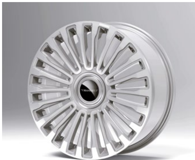
CS.11 multispoke wheels 19 inch CS11 19 85 45 1230 S Diamond silver