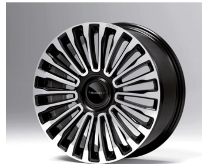
CS.11 multispoke wheels 19 inch CS11 19 85 45 1230 B Diamond black