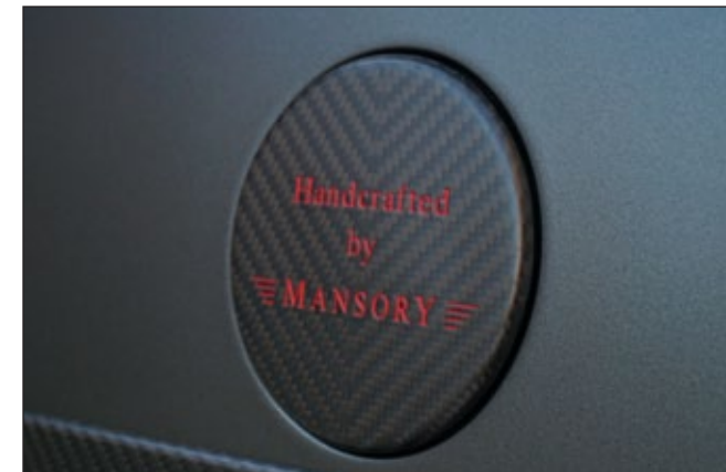
Rear hatch emblem ..... 447 802 761 visible carbon fibre glossy*