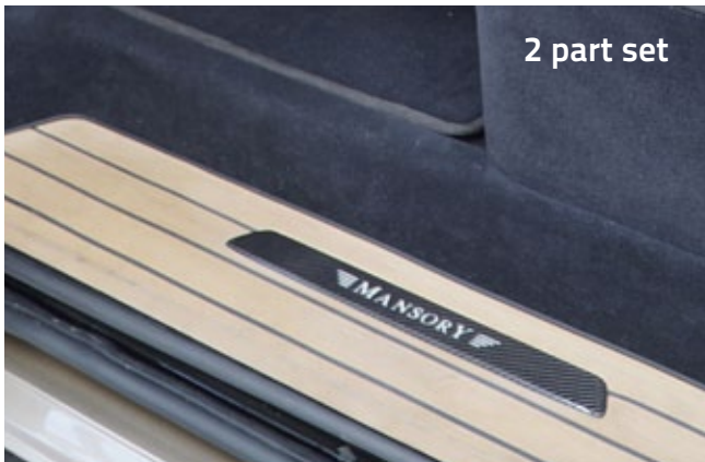
Sill plates with Illuminated MANSORY logo ..... 448 395 351 2 parts set, visible carbon fibre primed without clear coat with illuminated MANSORY logo ..... 448 395 355