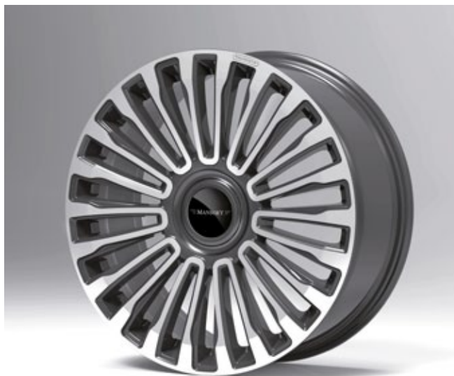
CS.11 multispoke wheels 19 inch CS11 19 85 45 1230 A Diamond anthracite