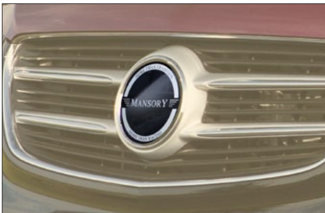
Front grill mask emblem ..... MMB 102 351 with MANSORY logo