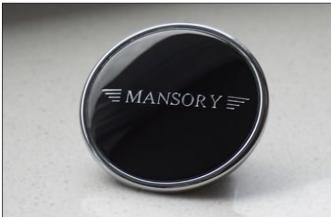
Logo emblem badge for Mercedes bonnet ..... MMB 102 665 Replaces MB star for original engine bonnet