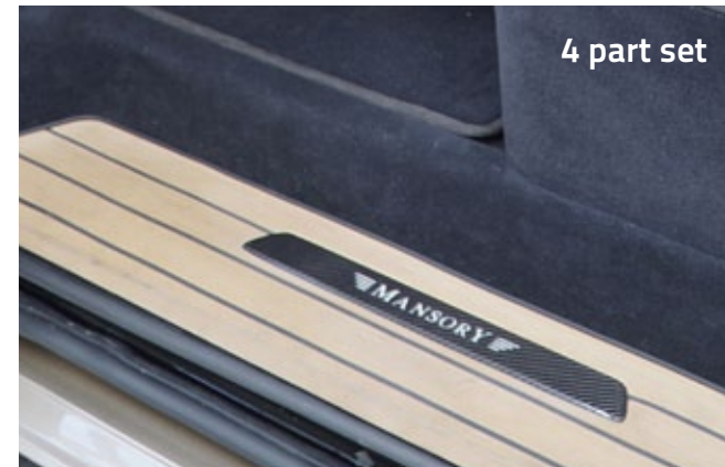
Sill plates with Illuminated MANSORY logo ..... 448 385 351 4 parts set, visible carbon fibre primed without clear coat with illuminated MANSORY logo ..... 448 385 355